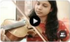
#3 Ye jo des hai tera ⋮