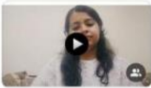
#2 InShot_202... ⋮