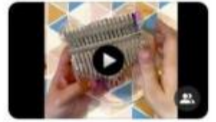
#8 Jana gana mana... ⋮