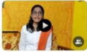
#5 Republic Day.mp4 ⋮